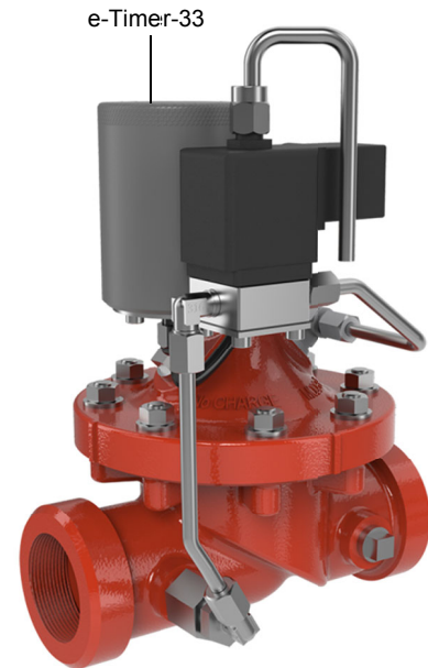
Example of assembly:

Flushing Valve type CLA-VAL ECO 32-27 with e-Timer